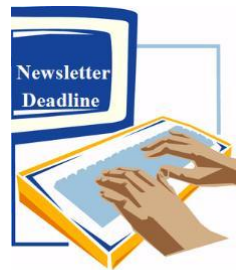
Monday, Aug. 12